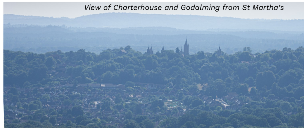
View of Charterhouse and Godalming from St Martha's