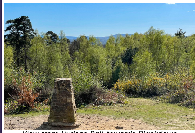
View from Hydons Ball towards Blackdown